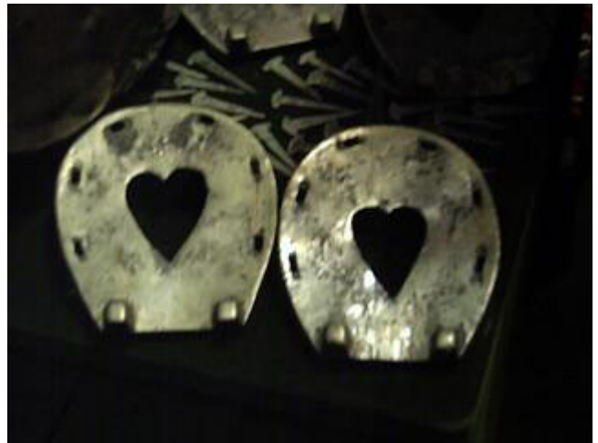
Horseshoes any horse would be proud to wear

Following the Armory tour, we proceeded to the "Diamond Fund" to view the extensive and breathtaking collection of gems, jewelry and precious metals belonging to the Russian Federation. (Any woman would be so lucky to have such a collection).