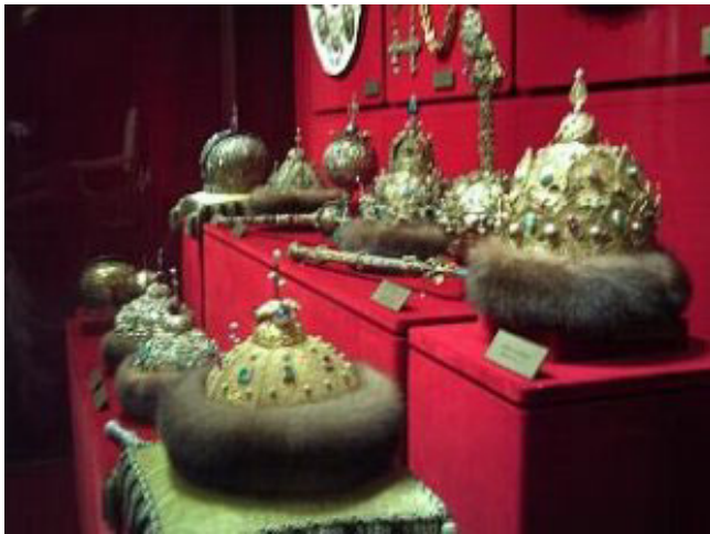
A collection of crowns and scepters and other ornaments

We proceeded to the Kremlin's Armory where we toured the exquisite displays of historical and religious artifacts dating back to as early as the 12 century A.D.